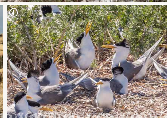
IMAGES 1 Rock Wallabies, credit Quentin Chester | 2 h Island Lighthouse, credit Isaac Forman | 3 Western River, credit Quentin Chester | 4 Crested Terns