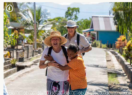
IMAGES 1 Wayag Island | 2 Exploring Hatta Island | 3 Kayaking from the beach | 4 Laughing with the locals at Tagalaya Island