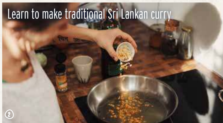
Learn to make traditional Sri Lankan curry