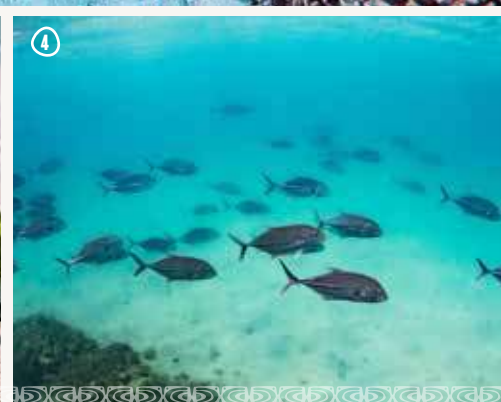
IMAGES 1 Hawksbill turtle, Maldives, | 2 Street scene, Antsirananana, Madagascar | 3 Leong San Tong Khoo Kongsi, Georgetown | 4 School of fish