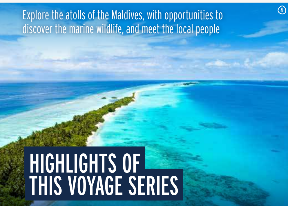
Explore the atolls of the Maldives, with opportunities to discover the marine wildlife, and meet the local people