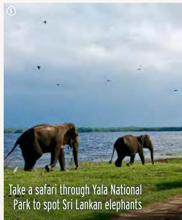
Take a safari through Yala National Park to spot Sri Lankan elephants

Our Australian team of Expedition Leaders and regular Guest Lecturers have a wealth of knowledge of the unique landscapes, flora and fauna and cultures of the Indian Ocean islands and Indonesia. Passionate explorers, marine biologists and naturalists, they provide on board lectures and interpretation and are always keen to chat with you and share their expertise. They will ensure your experience is as enlightening and enjoyable as possible by bringing you a new understanding and appreciation of the places you will discover on your expedition.