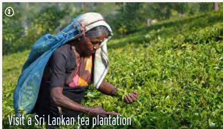
Visit a Sri Lankan tea plantation