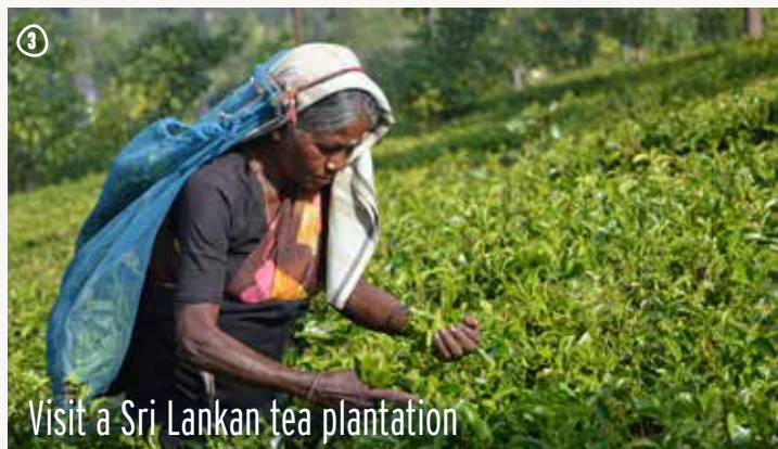
Visit a Sri Lankan tea plantation