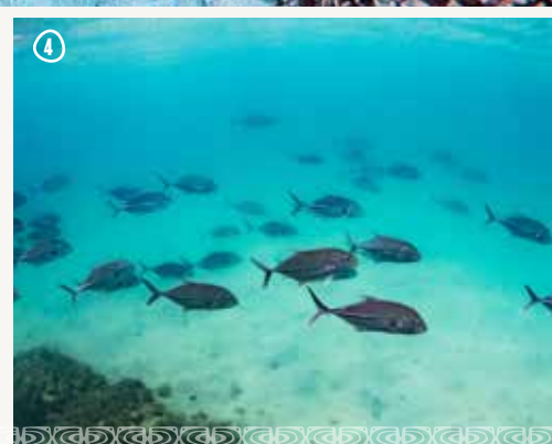
IMAGES 1 Hawksbill turtle, Maldives, | 2 Street scene, Antsirananana, Madagascar | 3 Leong San Tong Khoo Kongsi, Georgetown | 4 School of fish